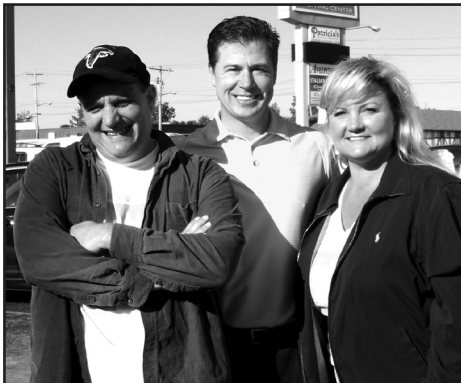
Doug Pitt of the Care to Learn Foundation with Kevin and Liz—Doug shared how OFH's Weekend Backpack Program™ is essential to the community.