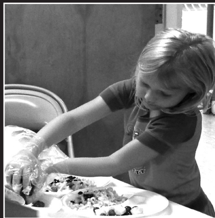
One of the Kids Cafe® Summer Feeding Program participants plates salad and fresh fruit on July 1, when Chef Strichfield of Twin Oaks visited the Springfield Community Center.

You can ensure these children have meals on the remaining days of the week by giving to The Food Bank's Childhood Hunger Initiative online at ozarksfoodharvest.org .